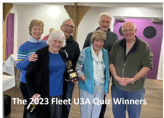
The 2023 Fleet U3A Quiz Winners

This is such a shame when people give up their time to run a group and it is not supported. Ed.